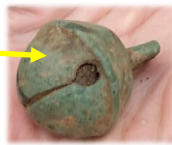
The mission was successful and you can hear it ringing again for the first time in over 150 years on our website.